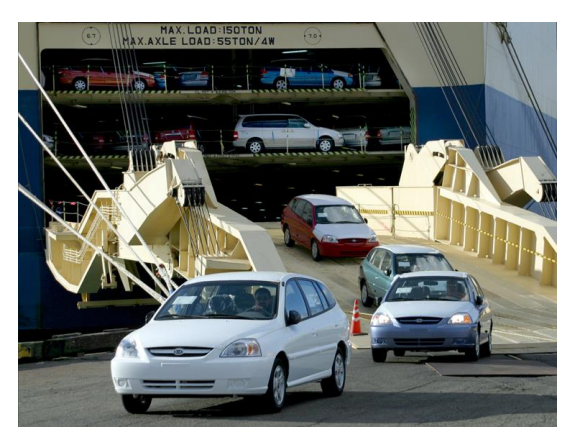
Autos = 175,802 Units