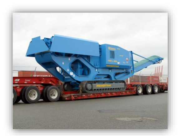
Breakbulk = 279,300 Short Tons