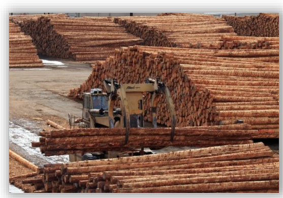
Logs = 304,930 Short Tons