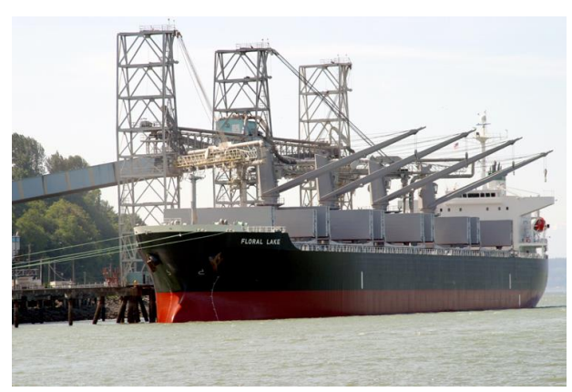
Grain = 8,321,336 Short Tons