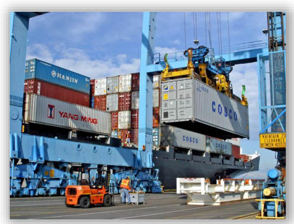
Containers = 3,427,561 TEUs